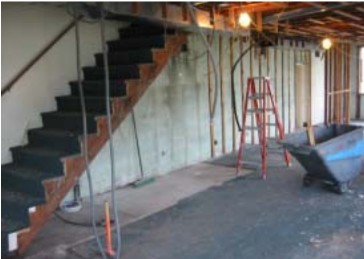
BEFORE: Front Office

Members and prospective members should drop by to take a look at our progress. We are located at 1407 Rome Road, off Benson Avenue.