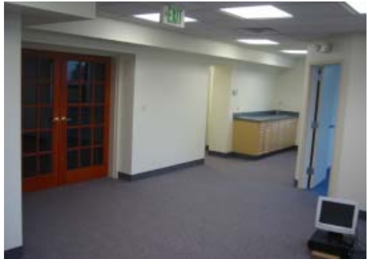
AFTER: Front Office