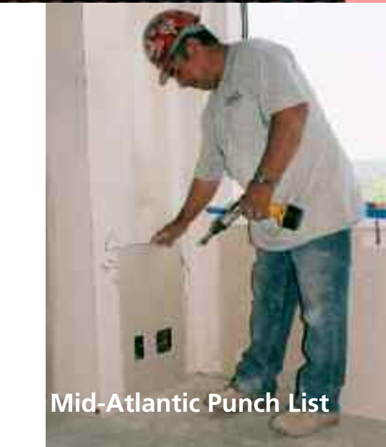
Mid-Atlantic Punch List

Contractors who cheat often bypass skilled workers such as these and then hire employees who they misclassify as “independent contractors”.