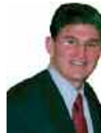
Governor Joe Manchin

"I saw you take ownership," West Virginia Governor Joe Manchin told